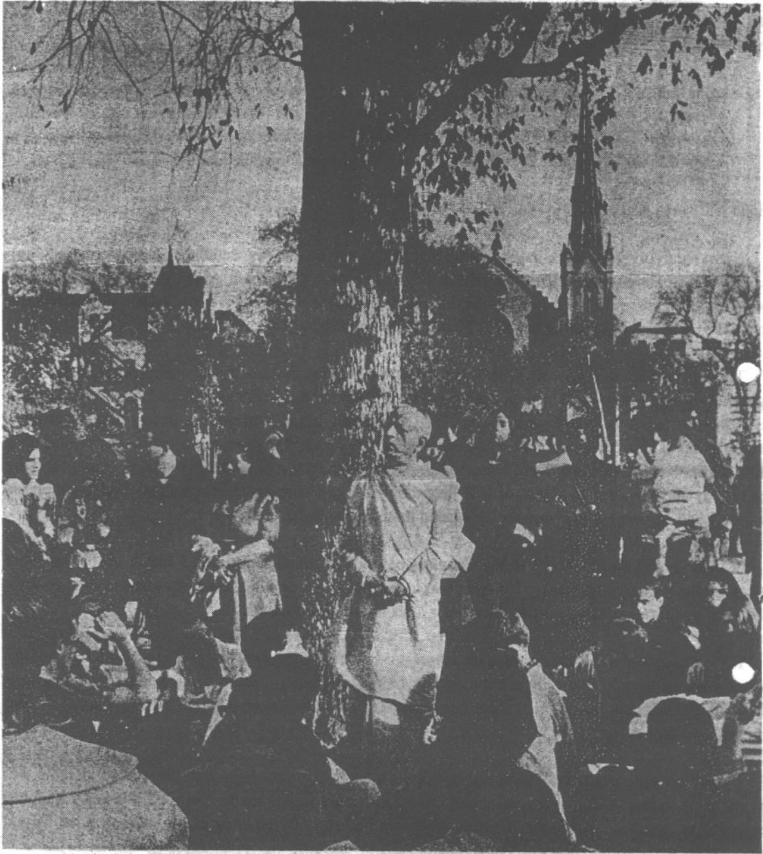
SWAMI A.C. BHAKTIVEDANTA FOUNDER ACHARYA INTERNATIONAL SOCIETY FOR KRISHNA CONSCIOUSNESS INC.