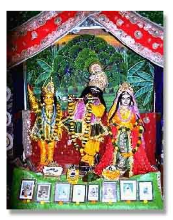
Sri Sri Gauranga Gandharva Govinda-sundara Deities of the Sri Chaitanya Saraswat Math