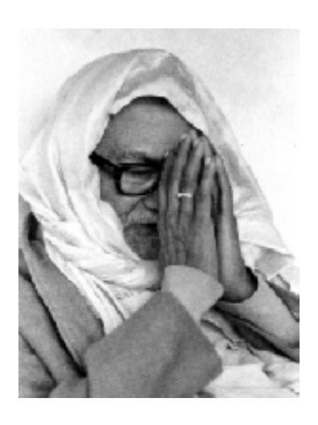
by Srila Sridhara Maharaja

Everyone is searching for rasa, pleasure. The status of rasa is the highest. As persons we have our subjective existence, but rasa, pleasure, has His supersubjective existence. He is a person. He is ahkila rasamrta murtih: the reservoir of all pleasure. He is Krsna. Rasa is Krsna. There cannot be rasa in any other place but Krsna. He is the fountainhead of all different types of rasa. So, by the nature of our constitution we have to search after Krsna.